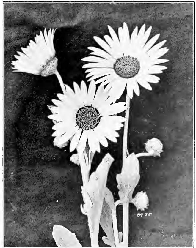
ARCTOTIS GRANDIS (AFRICAN LILAC DAISY)